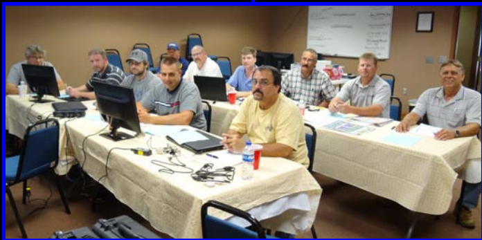
LECTURES & DISCUSSION

Classroom lectures provide ample time for information processing, discussion, and feedback with the instructor.